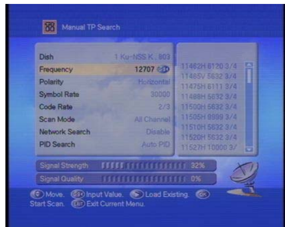
STEP 6 Using Remote Control – enter the numbers "1 2 7 0 6"