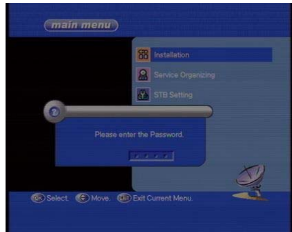
STEP 2 Click OK when "Installation" is highlighted and password window appears. Enter the digits "9 9 4 9" using the Remote Control