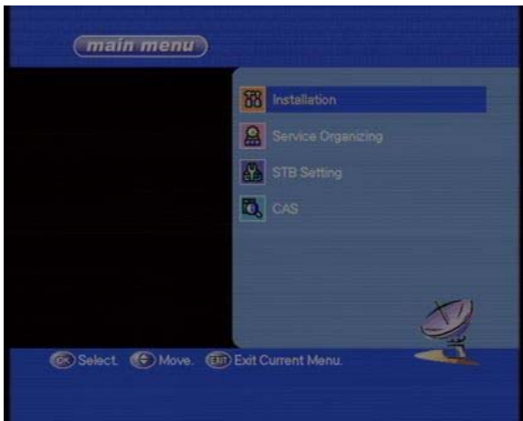
STEP 1 Using the Remote Control press "Menu" button. Main Menu screen appears with "Installation" highlighted