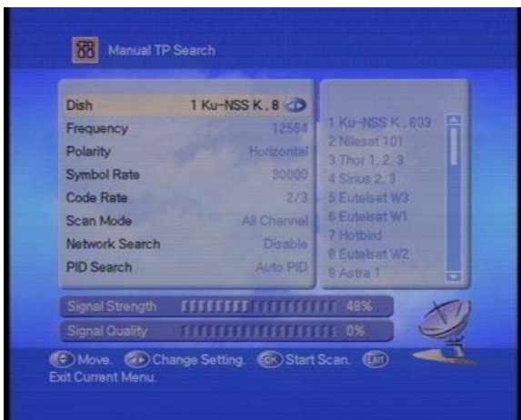
STEP 5 "Manual TP Search" Menu appears. Ignore the Dish name. Using down key scroll down to "Frequency"