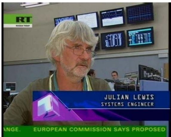
STEP 11 The STU will scan for the frequencies. Scroll to your favourite channel (Using Remote control do channel up). Please note after the scanning the STU may store previous list of channels in their current channel position and the new channel list added to it. Please scroll through all channels