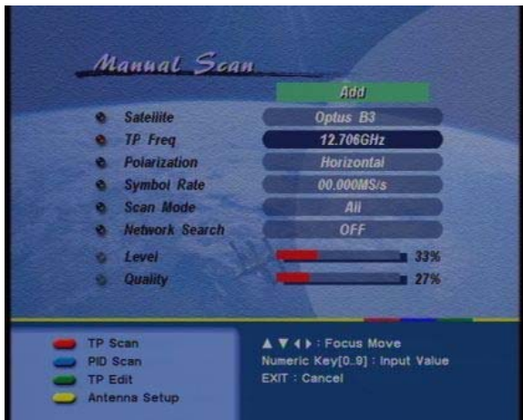
STEP 7 Select TP Freq and enter 1 2 7 0 6