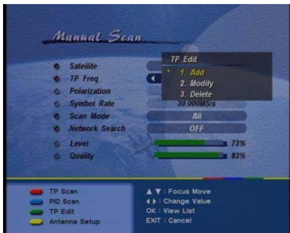
STEP 5 Click the Round Green button on the Remote Control. This shall open up a small TP Edit window. Select "Add" and Press "OK"