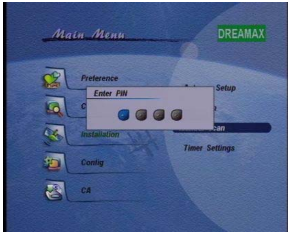
STEP 3 The screen will ask for a password.

Using Remote Control number pad key in numbers "0 0 0 0"