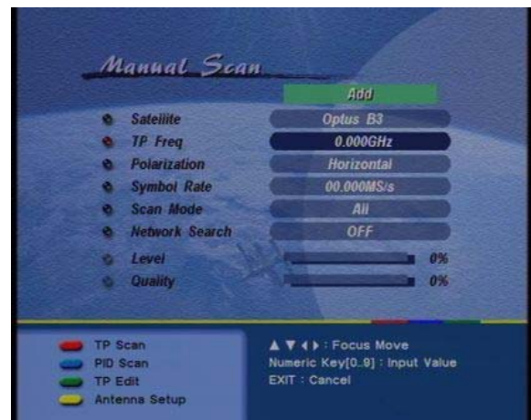
STEP 6 Manual Scan Menu opens up