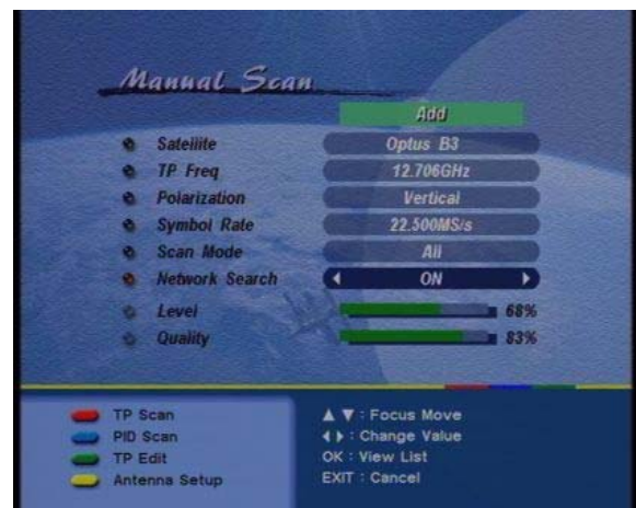
STEP 10 Go down Network Search and change it to "ON". Press the small Red button (above the arrow keys) on the Remote control