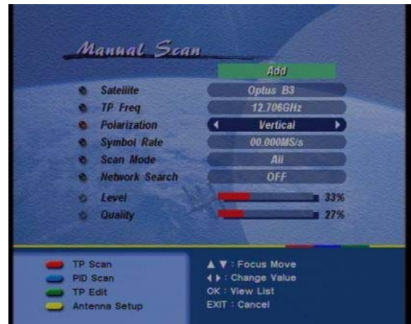
STEP 8 Go down to Polarization and change it to "Vertical"