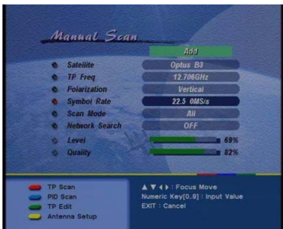
STEP 9 Go down to Symbol Rate and enter 2 2 5 0 0