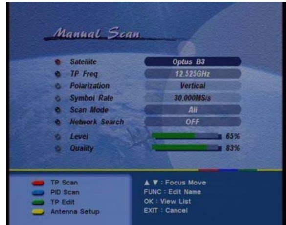
STEP 4 It opens up a Manual Scan Menu

Using Remote Control number pad key in numbers "0 0 0 0"